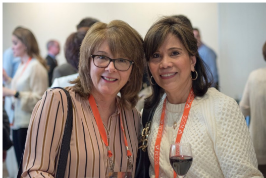
Members at the Texas SCCM Cocktail Reception at the 2018 SCCM Critical Care Congress in San Antonio